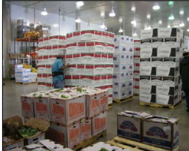
HDOA priorities will include inspection of incoming cargo from Guam to minimize the risk of brown treesnake introductions, as well as inspection of food products and animal feed.

Further authority to ensure uniform participation