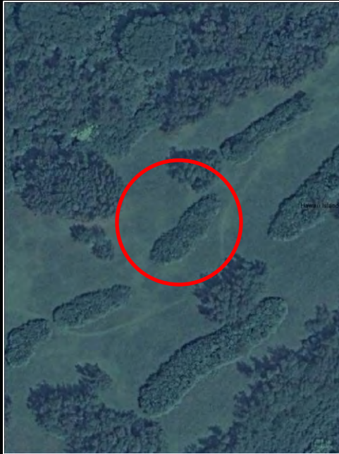
QUICKBIRD 0.61M RESOLUTION