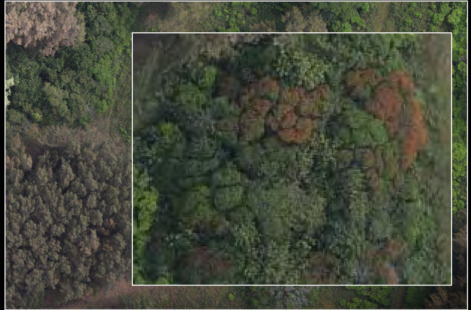
Resource Mapping Hawaii ULTRA HIGH RESOLUTION 1-2 CM