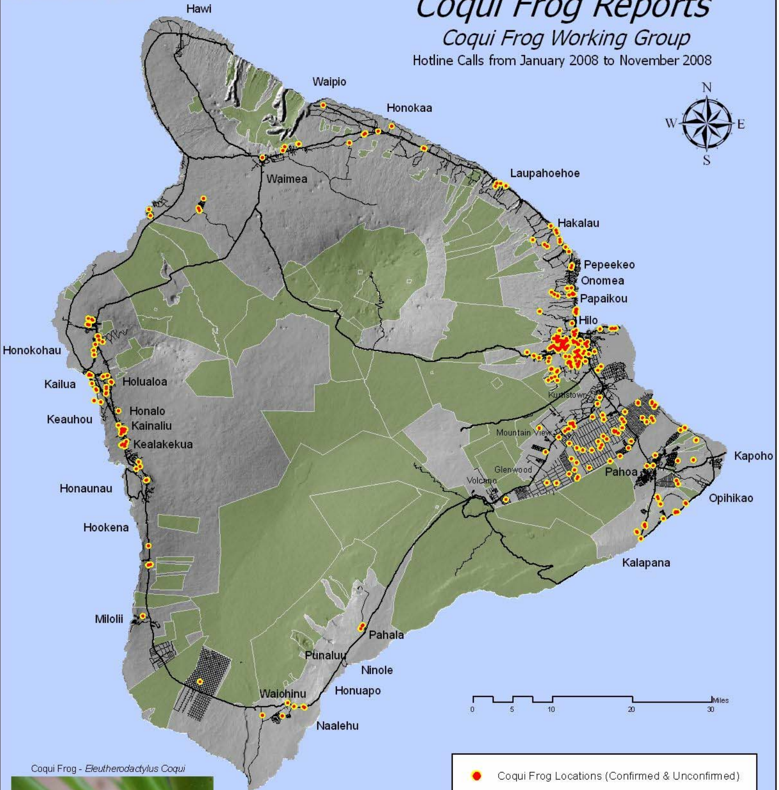
Coqui Frog - Eleutherodactylus Coqui

Hotline Calls from January 2008 to November 2008