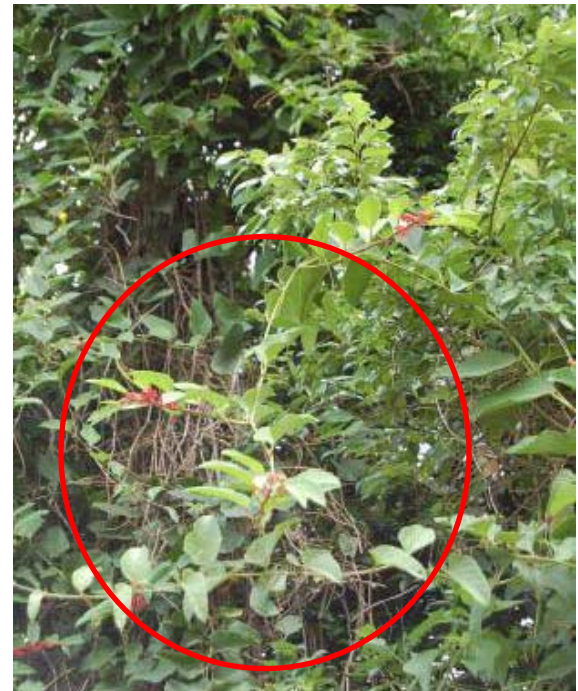
Image of Grape Ivy at known location on Kauai.