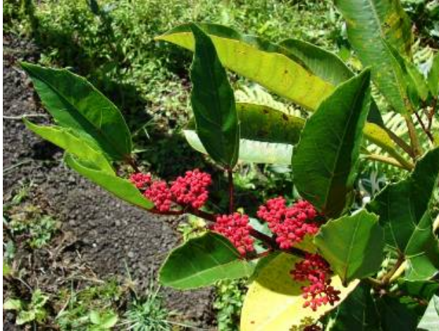
Grape Ivy

Common Name: Grape Ivy, Javanese Treebine